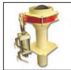
Plug Stack Inlet