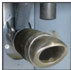
Timed Bag Seal