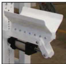
Powered Bag Chair