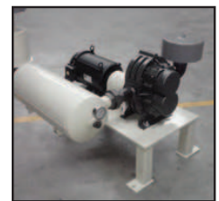
Low Pressure Blower